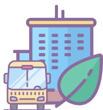
Housing and Transportation